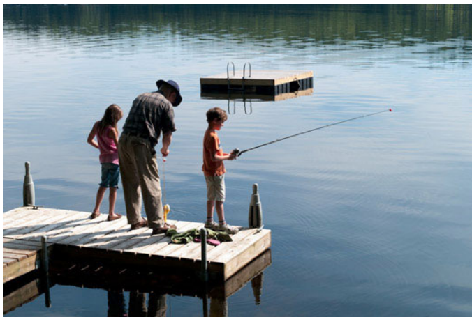
Introducing grandchildren to fishing