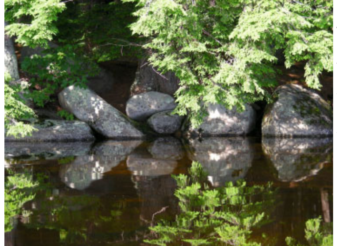
Summer 2009 Reflections