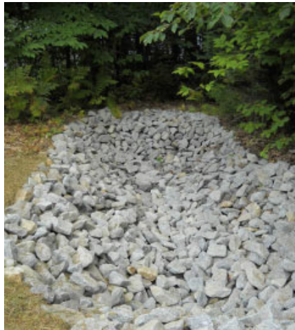
Erosion Under Control