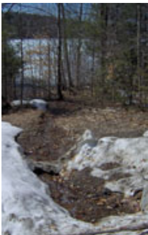
Water Erosion Before Control