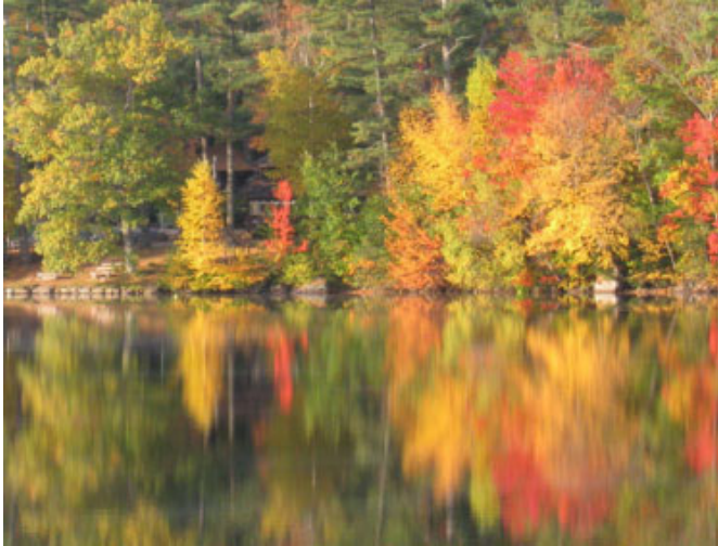
Fall 2009 Reflections