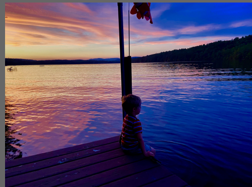
Summer daydreaming -- Four-year old Atticus Edwards